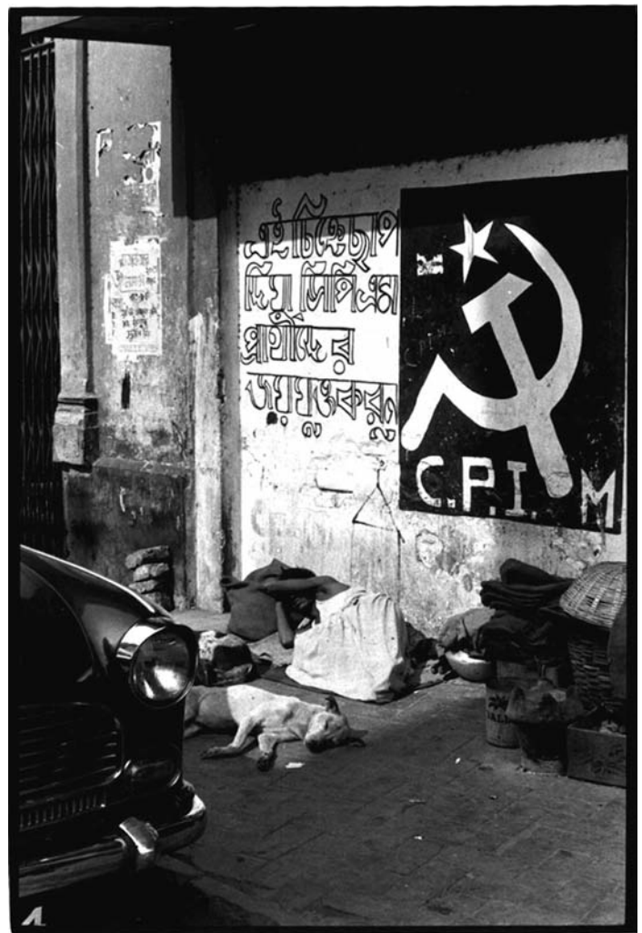
Man and dog sleeping under a 1980 election-time wall poster of the CPI(M).

On polling days, the Election Commission has full authority to mobilize government employees, such as teachers and security forces, to conduct the election. Most elections have violent incidents, including murdering candidates and ballot box stuffing. These occurrences have declined in recent years, however, as security has tightened; polling is on multiple days for up to a month. In cases where an election has been "countermanded," a fresh poll is held weeks later, with additional security—and invariably there is no further problem. Vote fraud still exists in a few areas, but even then affects only a small percent of the vote total. All voting is on Indian-designed and Indian-manufactured electronic machines. This has accelerated the vote count results, but even before these technological advances, elaborate pro-