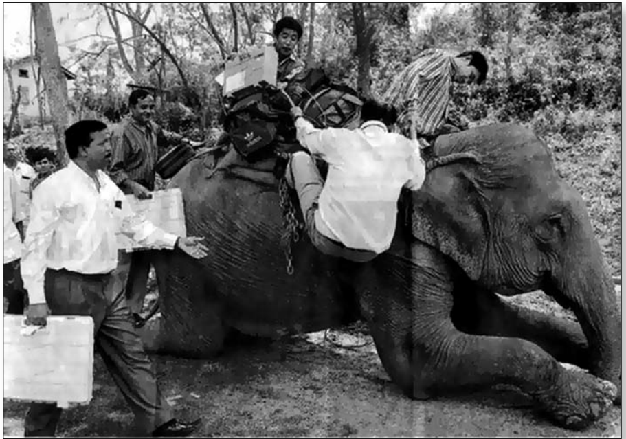
The photo caption: A MAMMOTH TASK: An election official climbing onto an elephant on his way to duty at Nartap in the Guwahati constituency on the Assam-Maghalaya border. Elephants, horses and country boats are being used for carrying the electronic voting machines and other material to the remote areas of Assam. Election is being held for six Lok Sabha seats in the first phase on Tuesday in the northeastern State.

The absence of a military coup, or even the threat of one, is one explanation for why India remains a democracy.