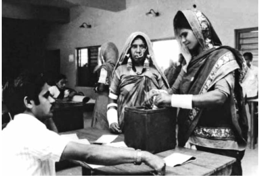
Tribal women casting their vote in Andhra Pradesh.

using such tools as demonstrations and litigation, but they usually steer clear of electoral politics. The rich, and even the urban middle classes, manage to advance and protect their interests in large measure through networks of kinship and common institutions, such as schools and colleges, social clubs, and professional associations. This form of interest-group politics by well-positioned groups is typical of not only India, but of all democracies.